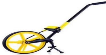
Fig. 4. Measuring Wheel.

Where F_w = the fraction of the soil surface wetted that take 1.0 for basin irrigation, and A_f = the average wet soil evaporation factor, [19] as shown in Table (4).