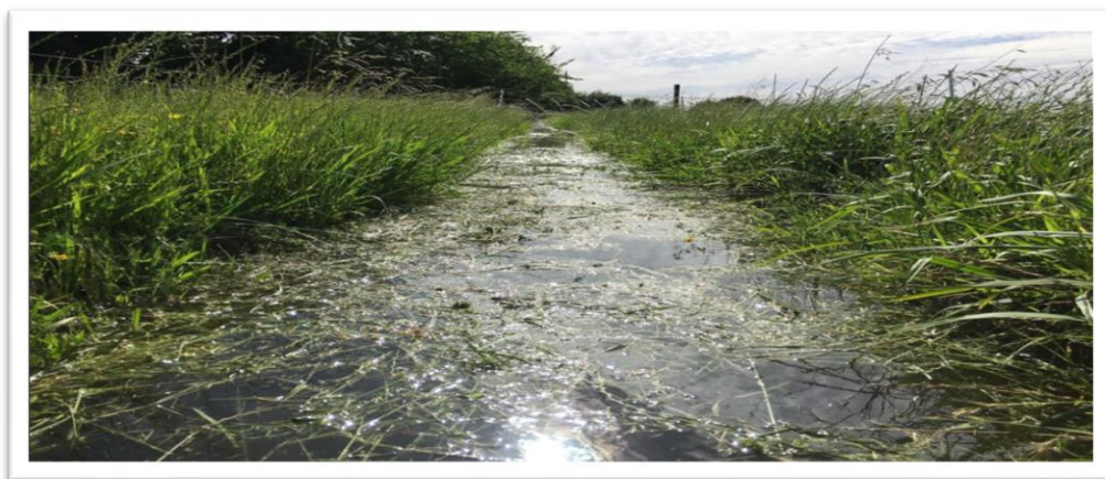
Fig. 6. Grass and weeds in Almanna canal

maximum of transpiration losses are in January and July respectively. At Almanna canal, the maximum rate of transpiration losses are in part one from intake regulator to km 10.450 and minimum rate of transpiration losses are in part four from km 23.030 to end at km 26.400. It may be due to the length of the section, as the section length increase, the amount of weeds and grass increases and therefore the transpiration losses increases. At Almanna branched canals, the maximum and minimum transpiration losses due to grass and weeds area in canals are shown in the following Table (6). Figure (6) shows the weeds and grass on the banks and sides of a canal in the study area.