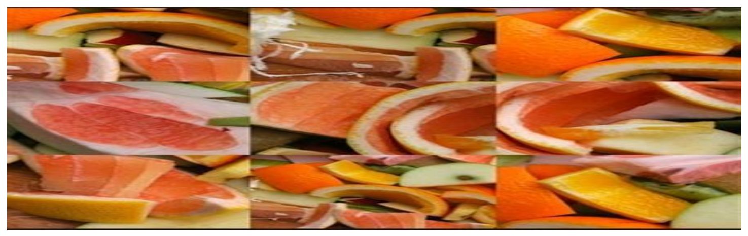
Don't throw it away anymore. The peel of this fruit protects you from cancer and heart disease