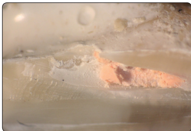
Fig. (1) Stereomicroscopic representative image of considerable amount of remaining intracanal filling in the coronal third, R-Endo group.

Different lower case letters in the same row indicate statistically significance difference. Different upper case letters in the same column indicate statistically significance difference. *; significant ( p < 0.05 ), ns; non-significant ( p > 0.05 )