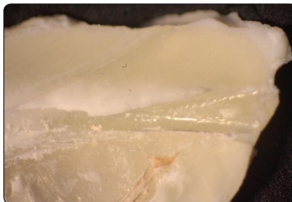
Fig. (3) Stereomicroscopic representative image of apical ledge from R-Endo group.