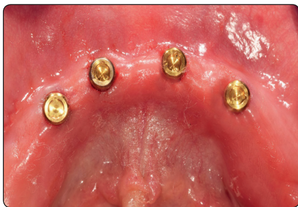
Fig. (2) Screwing of locator abutments to the implants

resin, the mandibular denture was removed, excess acrylic resin around the abutments was removed to avoid unnecessary loading of the implants and the denture was finished and polished. Black processing inserts were removed using locator tool (fig 3) and replaced with blue nylon insert (extra light retention) and dentures delivered to the participants with emphasis on oral hygiene instructions and occlusion was refined.