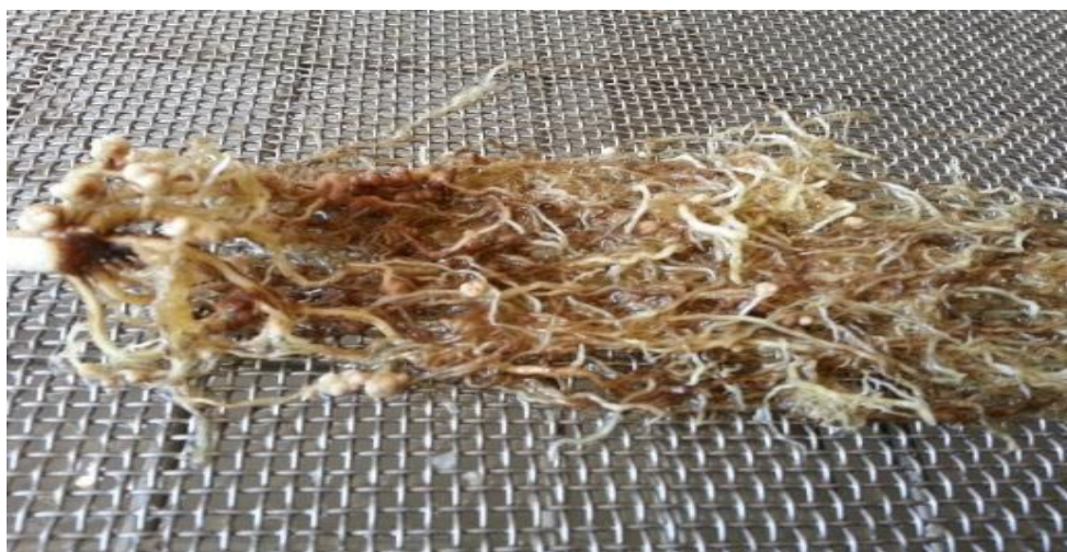
Fig. (2): Lupinus albus entire root with proteoid roots; photos taken by the first author.

Lupin produce cluster roots, which release vast amounts of phosphate-mobilizing carboxylates (inorganic anions) mainly citrate and protons that capable of making poorly available nutrients, in particular P, more available (Lambers et al. 2013).