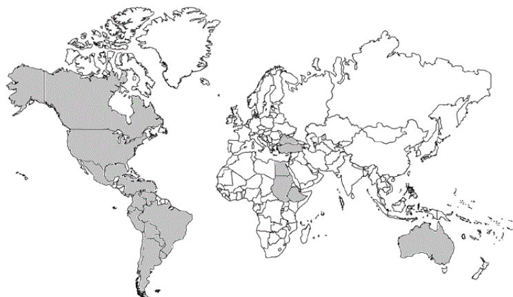
Fig. (3). Global distribution of Lupinus albus L. (grey color) in the World (prepared by the first author)

during the history of its cultivation; at present it has almost disappeared in central Europe, while it is becoming more widely grown in the Americas. (Fig. 3) Today it is a traditional minor pulse crop, grown around the Mediterranean and the Black Sea, and in the Nile valley, extending to Sudan and Ethiopia (Nigussie 2012).