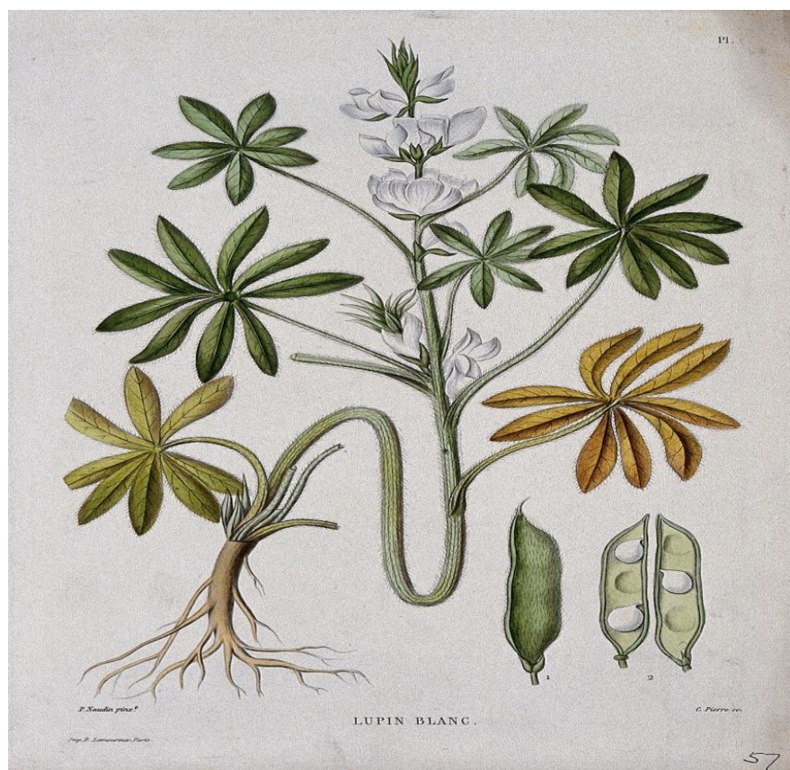
Fig. (1). Fig. 1 Line drawing of Lupinus albus entire flowering plant with pod, after Philibert (2019). The quantitative characters of Lupinus albus seeds shows that the mean of the seed

length and width almost the same in the two varieties (Giza1 and Giza 2), while the mean of its seed weight varies from 36.7 to 37.6 mg seed -1, thickness ranged from