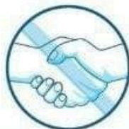
Avoid Shaking Hands