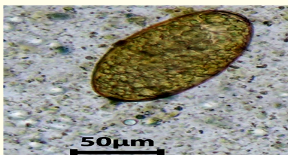
Figure 2: Fasciola species egg in fecal sample of infected animals by 400x under microscope.